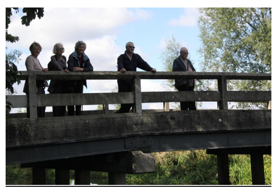
That's wrecked our game of Pooh Sticks.