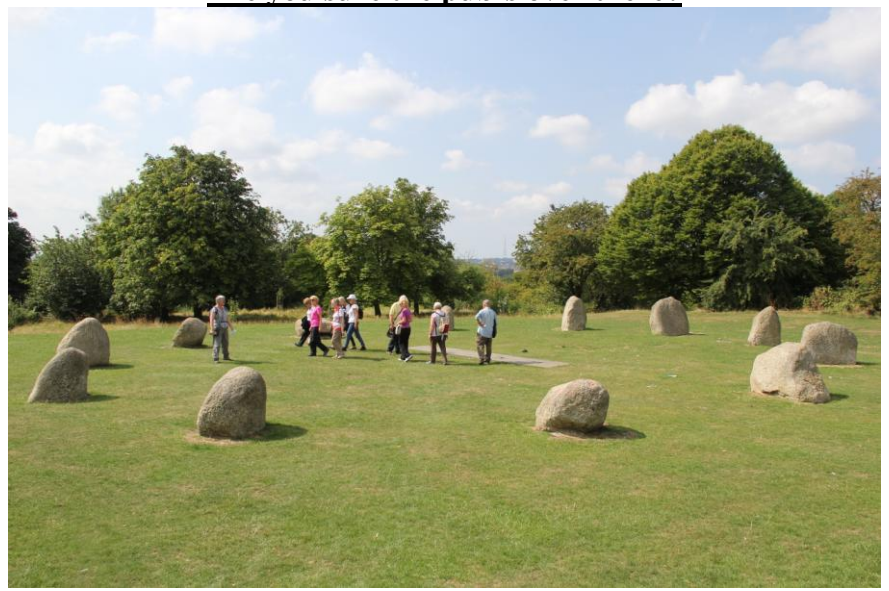
In the Stone Circle