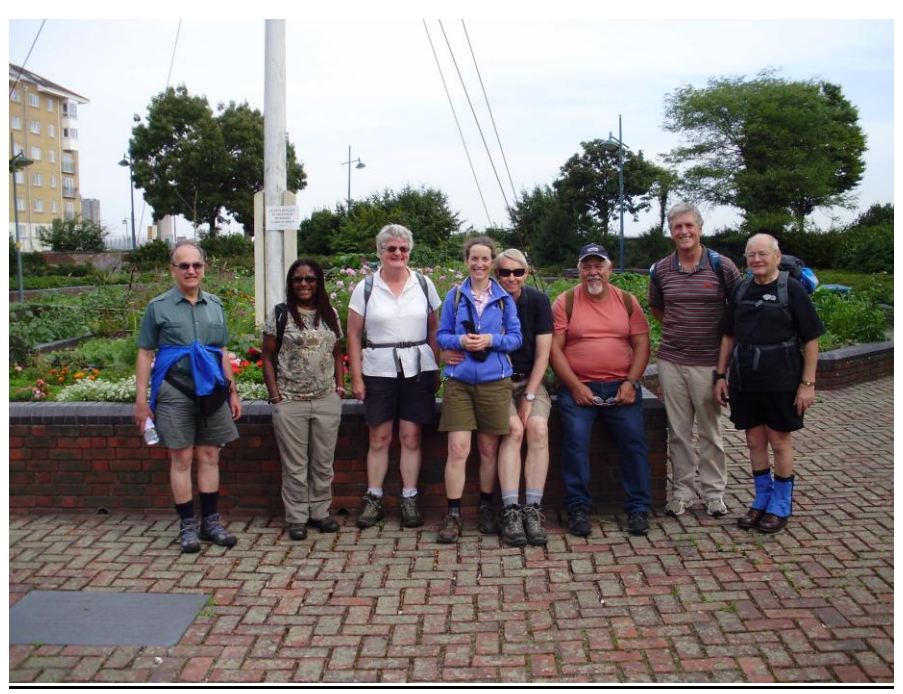
Start of the LOOP